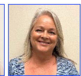
Darla Pence Gift Shop